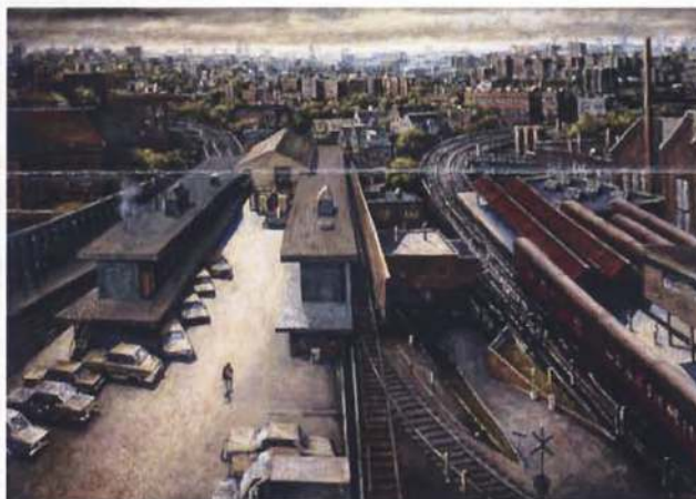
View From Bronx River Parkway II, 1998. Daniel Hauben Collection.

The Bronx County Historical Society Collections.